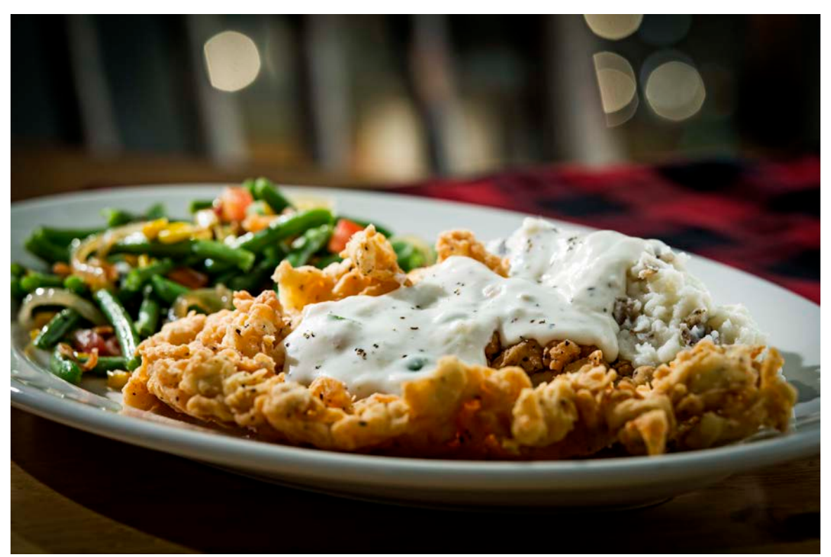
Twin Peaks' hearty Chicken Fried Steak is one of the many house-made entrées veterans and current military servicemen can enjoy for free on Memorial Day at their local Twin Peaks restaurant.